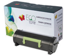
RKM3320 Bizhub 3320