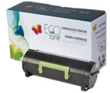
RKM3300P Bizhub 3300p