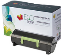
RKM4050 Bizhub 4050, Bizhub 4750