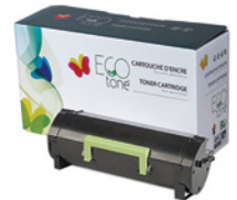
RKM4000P Bizhub 4000p