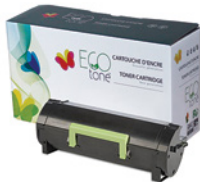
RKM4700P Bizhub 4700p